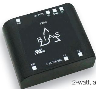
2-watt, actual size

-30° to 70°C Starting and Operating Temperature